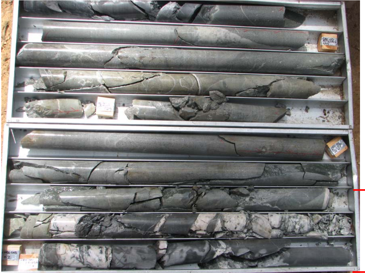
Figure 3: Core recovered from OBD001 across the New Long Tunnel dyke (approximately 419 to 426.15m). Note the prominent quartz veining across the lower contact as highlighted.

As the core is still to be cut and assayed, the gold grade of the intersections is not yet known. However, it is very encouraging that the mineralisation intersected between 424.95 metres and 426.15 metres is regarded as analogous in type and style to that of the adjacent Cohen's Reef, which is situated immediately to the east of the current drilling. The high grade Cohen's Reef, which was mined in the late 1800s and early 1900s, produced approximately 1.5 million ounces of gold from 1.4 million tonnes of ore.