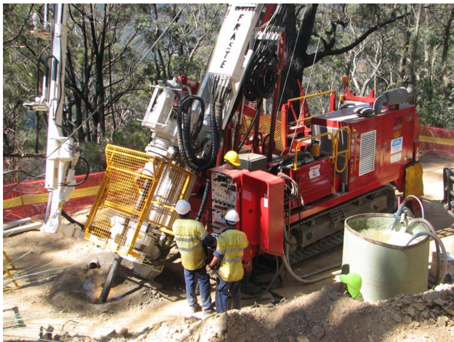
Figure 1: Drilling rig on Black Diamond Pad

The commencement of diamond drilling at the Walhalla Gold Project signifies another important milestone for Orion Gold. The current drilling program represents the culmination of months of detailed review of historic mining and exploration data by Orion Gold personnel, which has resulted in the identification of numerous high priority drill targets within the Company's highly prospective Walhalla Gold Project area.